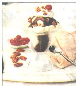
It's not too late to order six pints of Graeter's ice cream to take care of Dad's sweet tooth.

This is obviously special-event ice cream, both for price and taste. Richard Graeter, the fourth generation to make ice cream by the old French-pot method since 1870, says what makes his so special is that there is zero air in the product. "Nobody else makes it by the French-pot